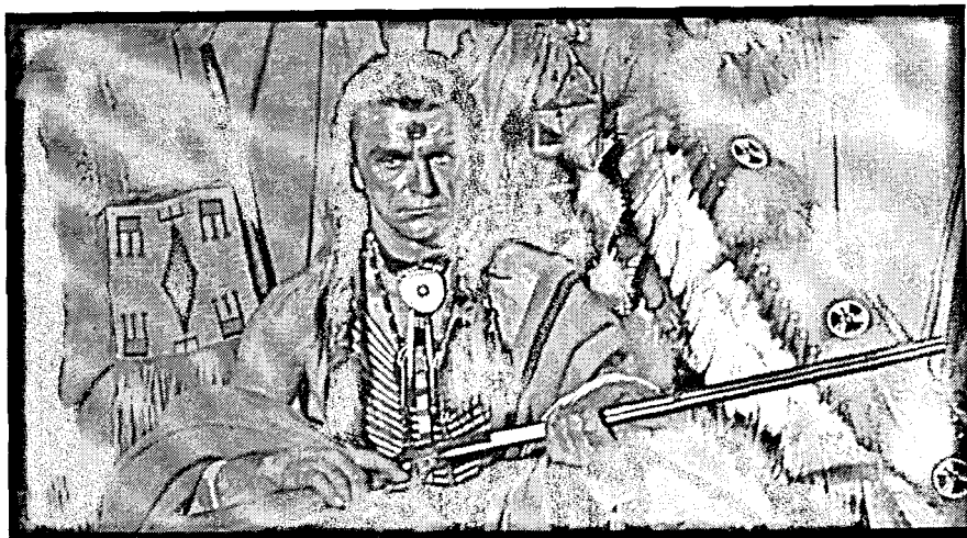
Henry Brandon (born Heinrich von Kleinbach 1912 in Berlin) as Quanah Parker