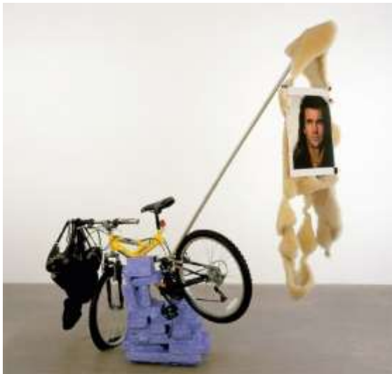
Huffy Howler , Rachel Harrison, mixed media, 2004