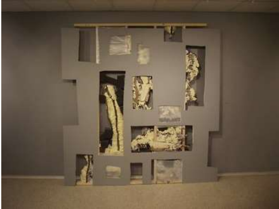
Wall Deconstruction, Storm Ketron, 2013, Mixed Media

Repetition and the act of searching for an individual sense of perfection through repetition is a main theme in this body of work. I perform actions that I am driven to perform repetitively in a fashion that makes for a certain absurdity. What I mean by this is that I perform tasks in sequences that can number in the hundreds in order to fulfill a quest for personal perfection. I then have to define what personal perfection is to make sense of my previous comment. Personal perfection may never be reached in my pieces, I believe my idea of personal perfection is performing a task in repetition until the possibilities and parameters that I create have been exhausted in such a way that satisfies my own selfish need for personal satisfaction. This enduring of actions, or formats, or materials, until personal satisfaction and relief is experienced creates an environment of unfulfilled tension within my studio, adding to the chaos within the constraints of format.