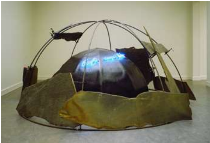
Plug In #33: Igloo Nero, Mario Merz, (1967-1979), 1994

certain respect creates a new class system, or really a new hierarchy. This new hierarchy may not be in terms of dollar amounts and prestige certain paintings, objects, or products can ascertain, but more in respect to how these things are now viewed. In “Design and Crime”, by Hal Foster he writes about how the New Yorker at the height of its power and prestige was seen as high-brow, is now in a sort of limbo not really falling into either the high-brow or low-brow system. This is due in large part to the ease of access that is now achievable in the dotcom era. An individual in Johnson City, Tennessee has the ability to access the same exact articles that a millionaire on Fifth Avenue may read. So here in lies the conflict that I came across, how can something that is commercially successful such as the New Yorker Magazine be no longer considered high-brow?