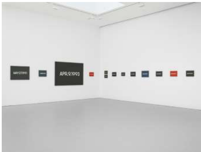
Date Paintings, On Kawara, Acrylic on canvas