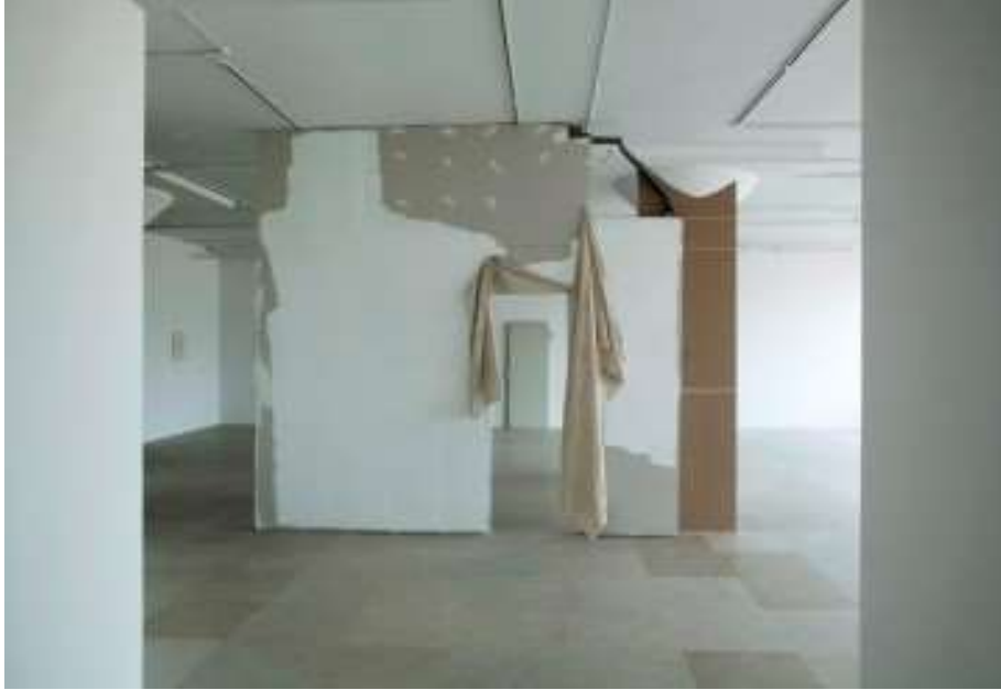
The Cutters, Gedi Sibony, 2010, Canvas, paint, wall, and vinyl. Courtesy of the artist and Greene Naftali Gallery, New York