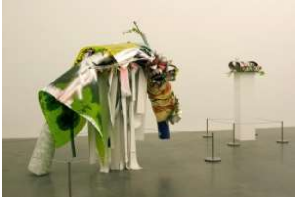
Empire Vampire I , Isa Genzken, Elefant , 2006

the aggrandized thoughts of what an art object should be. I choose materials that function in much the same way. Instead of a marble or bronze sculpture I instead choose Crayola crayons, or faux fur.