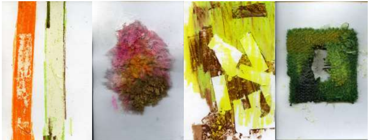
Discography Series (detail), Storm Ketron, 2013, Mixed Media

On display at the Unmonumental exhibition held at the New Museum artists such as Sarah Lucas, Isa Genzken, Jim Lambie, and Rachel Harrison also explore ideas of low brow materials as high brow art. They combine alternative art materials such as cement, brick, fur, and bubble wrap in much the same way that they are implemented in my Discography Series. These artists are responding to a cultural climate, characterized by an indiscriminate amount of styles, trends and ways of making, through deliberately apathetic formal gestures that run against the grand allusions of modern art's rarefied steel and marble towers. These artists are breaking down