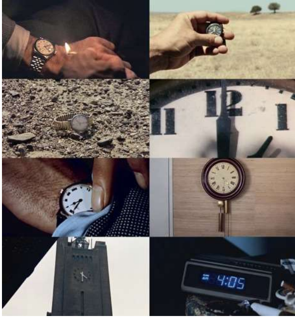
The Clock, Christian Marclay, 2010

Kawara's work uses time as an object of the past. The "now" that he is displaying with his Date paintings has already passed, what is left is the reminder, the documentation of that particular day. The individual pieces in my Discography Series function as reminders or documentation of the "now" in which they were created. These come to represent minutes and seconds of actions which is dictated by the individual song length. This creates a systematic reduction of time down to fractions of seconds, rather than in representing the long spaces of centuries. Both past and future are placed into an objective present (Smithson).