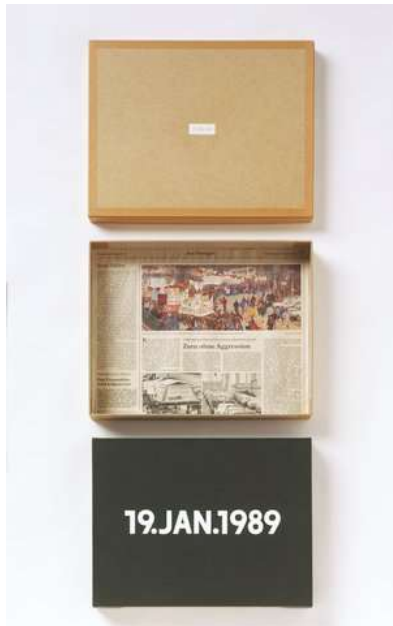
Today Series, On Kawara, 1989, acrylic on canvas

The Discography Series draws influence from cultural responses to time and how quickly climates, in both a socio-political sense, change and the overall speed of information that is available to the individual. I believe this has greatly influenced the speed and techniques that I apply in my own practice. I am forced and controlled through the time frame of a song's length to make these impulsive, and usually aggressive/angry marks onto the surface of my individual pieces. I consume the song dynamics, not in a regular sense, but in a sense that I engage in the tones of the song or the overarching feel of the song and simultaneously spew marks or objects onto the surface. This time limit gives the sensation of automation in my work I feel as if each song is a part of a larger unit, where I am just a single assembly line worker putting the correct pieces in the correct order in as fast of a pace as the line dictates. This is the state in which I create the discography series. I believe this notion of the creation of art being a mechanical/labor process comes from my upbringing and how I was witness to the everyday automatism of the workplace that my father was a part of. My father was working at the Electrolux plant at the Bristol, Tennessee location when I was growing up. According to the official website,