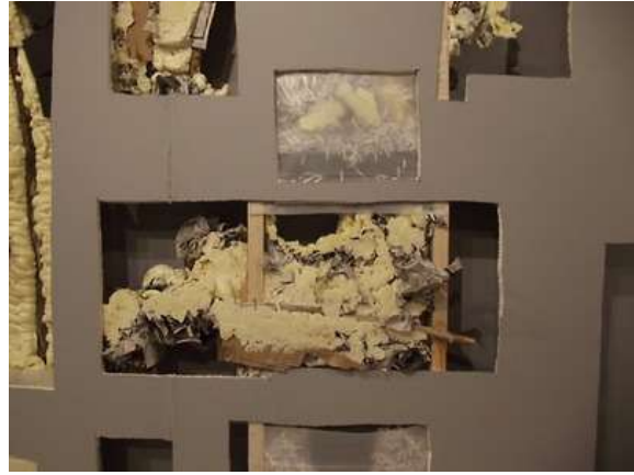
Wall Deconstruction (details), Storm Ketron 2013