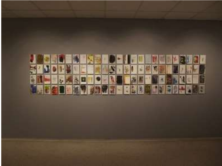
Discography Series, Storm Ketron, 2013; Mixed Media