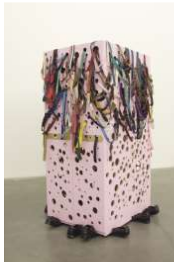
Split Endz , (wig mix), Jim Lambie 2005 mixed media