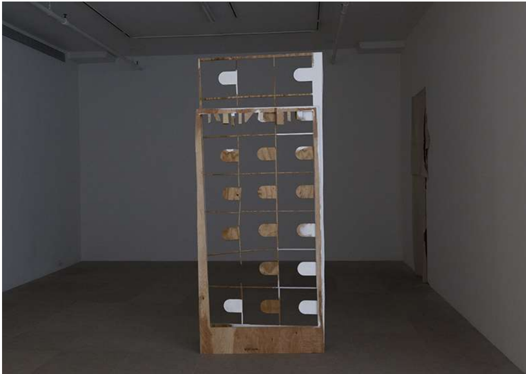
All Her Teeth Are Made of Slate, Gedi Sibony, 2013, wood paint and screws.

examines the importance of material. Often evoking the modesty of everyday materials, neo-formalism appeals to the simplicities of artistic labor, a last bastion of humanity's endangered (yet "enduring") tactile engagement with matter (Geers). This tactile engagement with matter goes through in Sibony's work with his use of the everyday materials of constructions. Wooden doors and industrial carpet are given a new life in the gallery from the debris of the everyday they gain greater implied significance and come to represent labor as art, in a similar way that I am working with industrial materials.