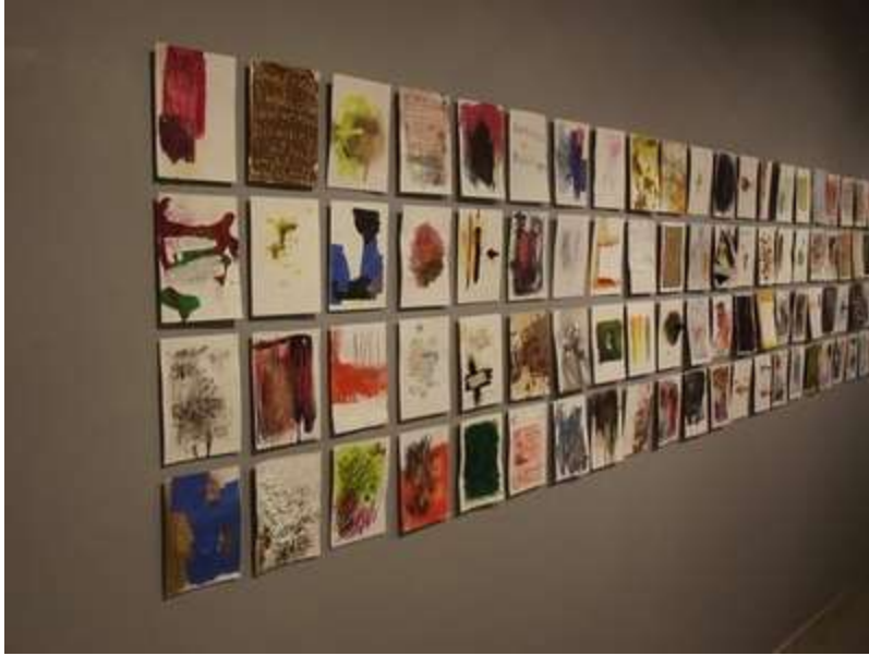
Discograhya Series (detail)