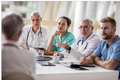
Minimum Data Set (MDS) Research

Research to produce a workforce to meet the nation's behavioral health needs