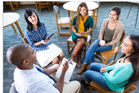
Characteristics and Practice Settings Studies