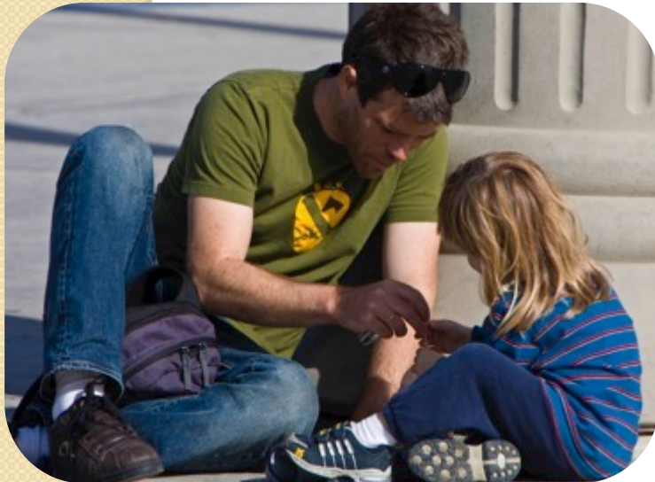
Father and daughter