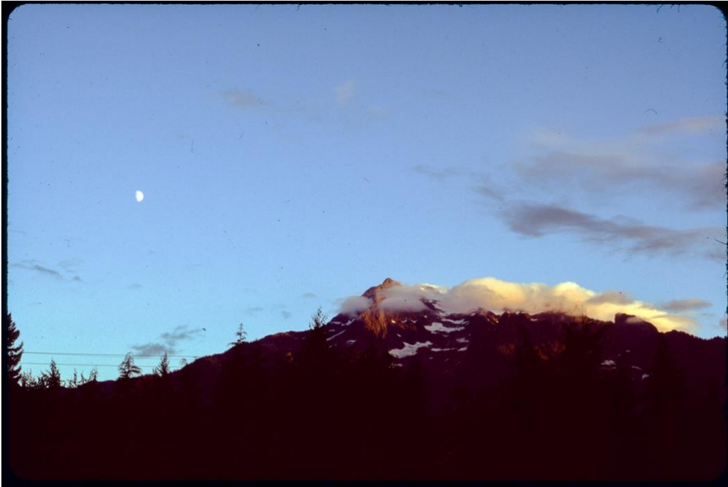
Figure 1. View of Whitehorse Mountain from Darrington Bluegrass Music Park campground (Darrington, Washington), ca. July 2007. Scanned from slide.