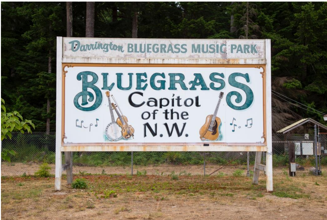
Figure 2. Sign at entrance of Darrington Bluegrass Music Park (Darrington, Washington), July 2017.