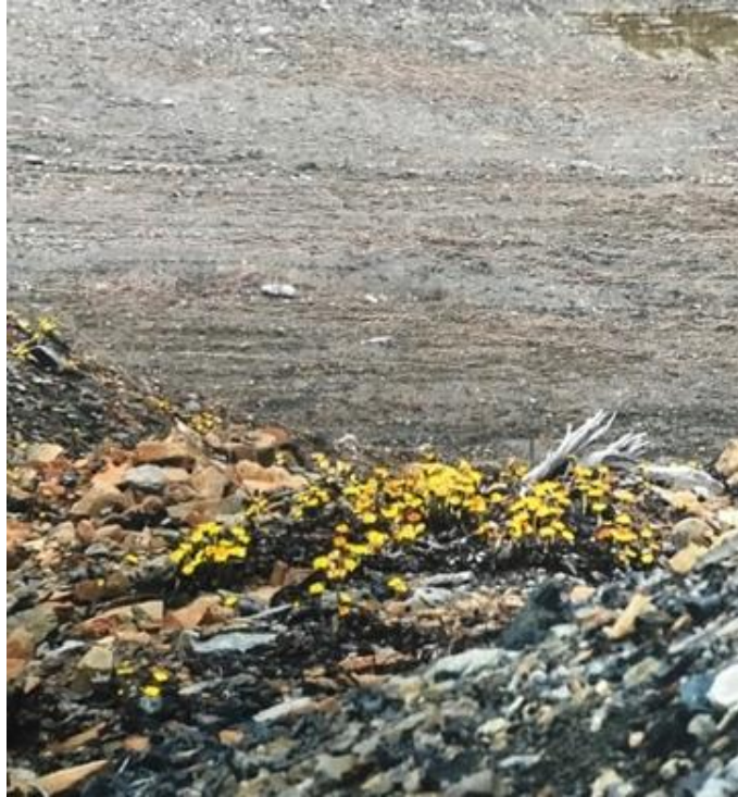
fig. 7 detail RECLAIMED

RECLAIMED , like St Paul's on the way to Damascus addresses the concept that the damage to the land by MTR can be dealt with by putting back what was removed. The issue at hand here is the only reclamation that is going on is being done by the birds and the wind. This scattering of coltsfoot seeds which have taken root in this inhospitable ground and bloomed is embroidered in yellow situated in the foreground to make the point that became the title of this piece.