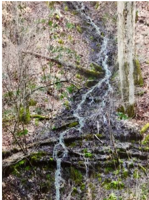
fig. 3 detail Hydrologic

green of the scene that is underneath, printed with the same image that has been “damaged”. Attempts to repair the hidden damage are made visible with the use of fabric paint and an addition of layered repeat transparent images that are stitched to the surface to imply putting the ‘torn and tattered’ areas back together. This piece is the introduction to the wall images in the exhibition, which lay deeper inside the gallery. The conversion of an illegal dump (where the photograph was taken) back to a wetland in SW Virginia implies the hope for the rest of the land, that what has been destroyed by MTR in the pursuit of coal, can be reclaimed. The damage to the layers of this piece proposes to highlight that restoring MTR sites may not be easy or even possible. This work serves as the first inkling that what lies behind the floating wall in the gallery might be uncomfortable or challenging.