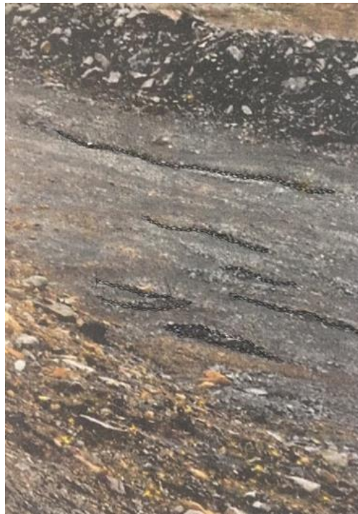
fig. 5 detail An Unnamed Road in Appalachia

GHOST , a layered image of what is left is the next work in the exhibit. It was the first image printed and the impetus for the focus of this thesis exhibition. The image in the piece consists of the remnants of a mountain that is part of Looney Ridge. At first glance, it appears to be right out of the Southwest part of the North American continent, then it becomes quite apparent that this piece is of a mountain with much missing, the road leads up to, and goes past, this diminished mountain peak. The piece consists of two layers, transparent silk over cotton of the same place on that road that is hung slightly separated so the top image appears to be floating, suggesting a mere shadow, semblance or trace of the mountain that was there.