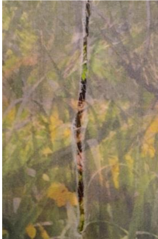
fig. 2 detail St Paul on the Way to Damascus

influential in the creation of the installation of ersatz trees. These woods are completely hand made and creating a rigging from which the trees would be hung so they are not touching the floor felt the best choice to add to the deceit, as trees are rooted and this is well documented by Peter Wohlleben 20 This was more an attempt to beguile the person with these fiber forms than to portray an accurate rendering of trees.