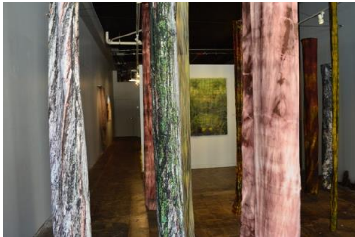
fig.1 The Beauty Strip

Es-sen-tial as a site specific installation was created with the exhibition space in mind. There was a desire to express my own environmental activism of living sustainably through art.