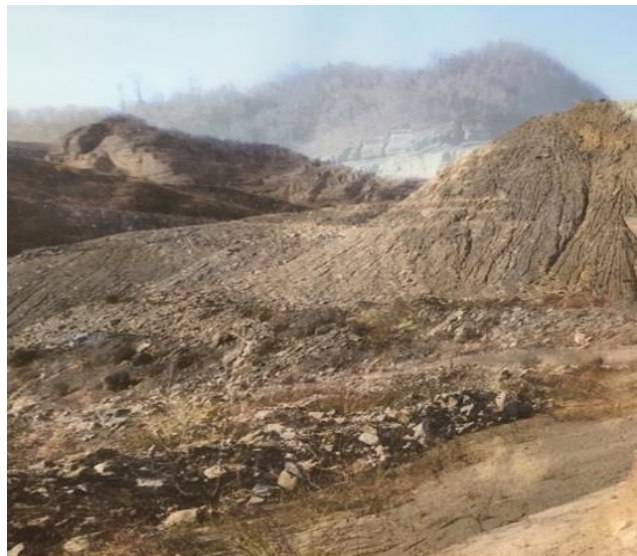
fig. 4 GHOST

layering of a shadow on the wall behind the work. A streambed filled with clean clear flowing water is an expected scene when driving or hiking through the mountains, this tumbling of water over rocks is something we are familiar with. This stream, however, is man made and I have placed it at the start of this journey to draw attention to water. What is not seen, just off the image portrayed, is the settling pond that has sprung a leak, the clear clean bluish water is not what it appears, it is a leakage of harmful water through erosion in the wall of the manmade impoundment above. These intermittent and ephemeral streams that appear and disappear with the seasons and the rains do not create a foundation to restore the broad forest ecosystem that was destroyed by the mining event. 21