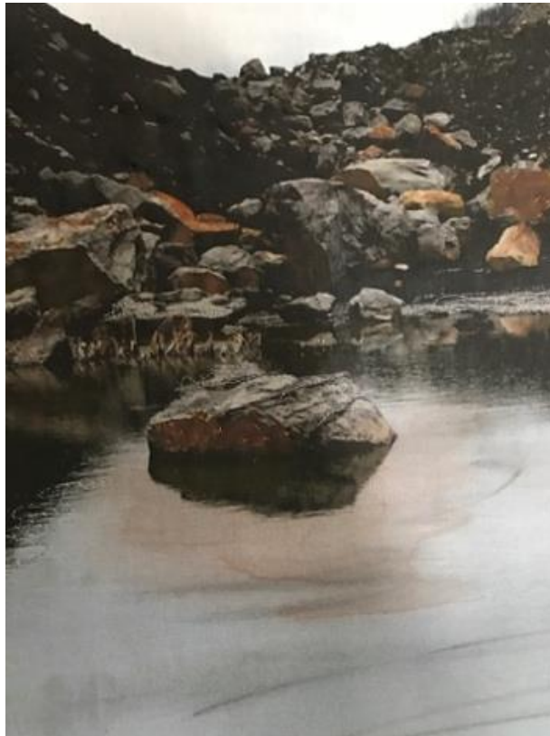
fig. 6 detail UNSETTLED

place to place. This road had a purpose for the mining process but is deteriorating as it's use is no longer needed, the land impacted then left to restore itself.