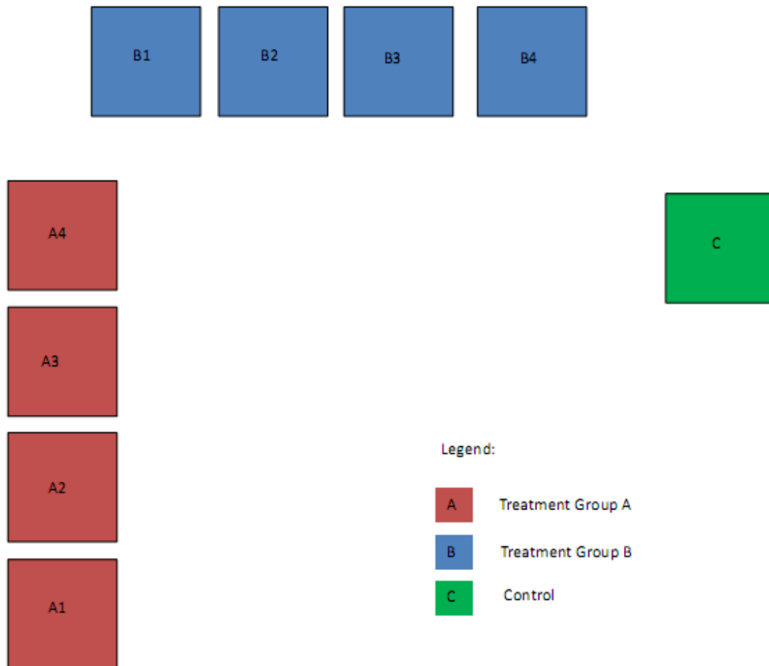
Figure 2: Biosand Water Filter Testing Groups and Physical Arrangement in the Lab

microspheres (group B), and one control (C). The two testing groups were established to delineate if the microspheres had an effect on the other measures because they were being poured directly into the BSFs. The control BSF was used to detect any environmental fluctuations influencing the testing. Only straight tap water was used for the control. Figure 2 represents the BSF placement in the lab. E. coli was added to the influent so that there was a known contaminant for testing. This organism was chosen because it is a common contaminant and there was a known source for isolation.