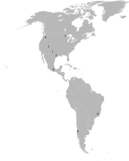
Fig. 1. Map of North and South American showing the location of Paleoindian and Paleoamerican specimens used in this analysis: 1. Arch Lake; 2. Gordon Creek; 3. Horn Shelter No. 2; 4. Kennewick; 5. Pelican Rapids; 6. Tehuacán (Tc50-2); 7. Warm Mineral Springs; 8. Cuchipuy; 9. Lagoa Santa.

d Date is from the level underlying the skeletal remains.