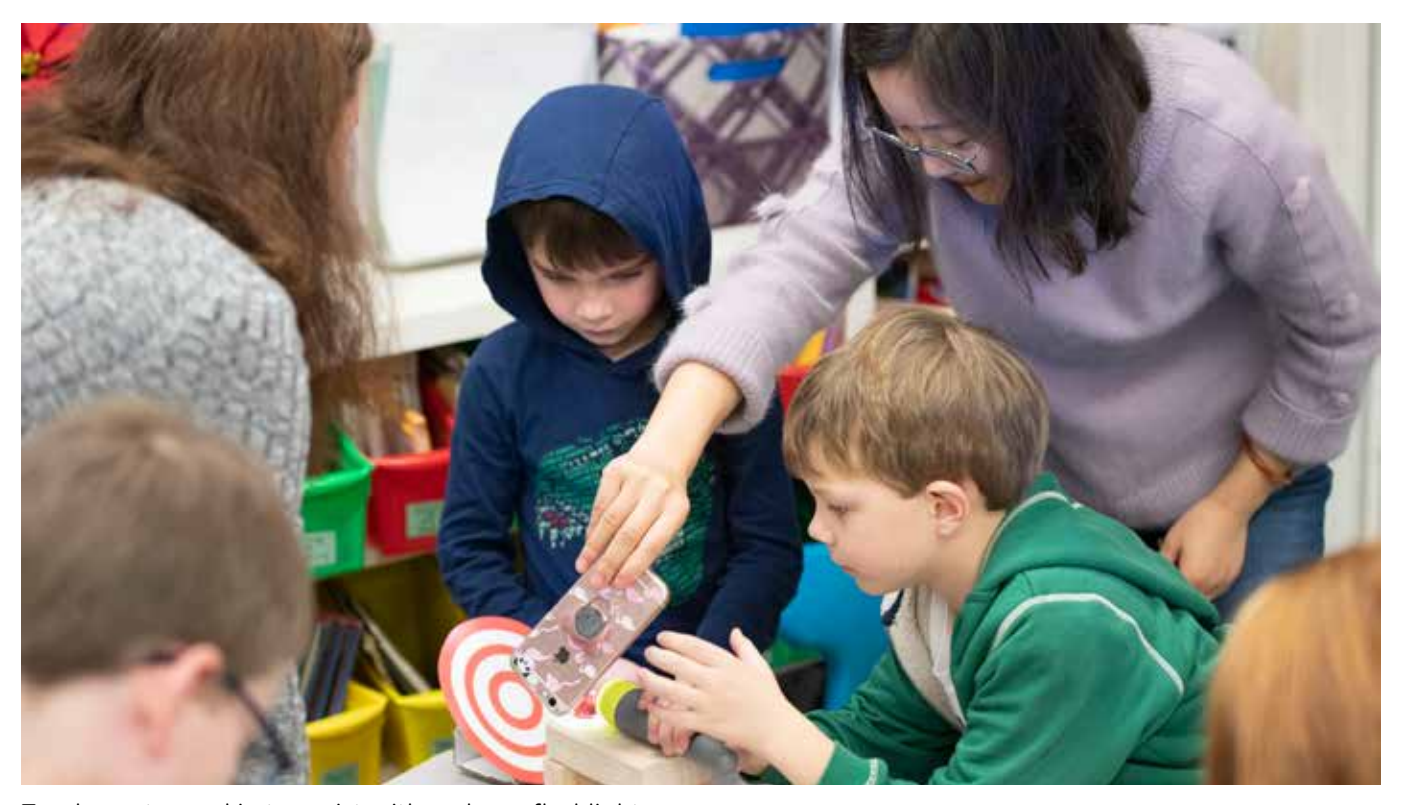
Teachers stepped in to assist with a phone flashlight.

After exploring their materials and designing their courses, students gathered on the rug to discuss their observations with the teacher. Students volunteered to share how they had achieved the goal and the challenges they had faced. As students made observations, the teacher and other students connected the comments to vocabulary. For example, when a student described the light shining easily through the magnifying glass, another student agreed and remarked that the reason is that the glass is transparent. The teacher used this comment to discuss the definition of transparent objects with the group. By conducting the class discussion in this man-