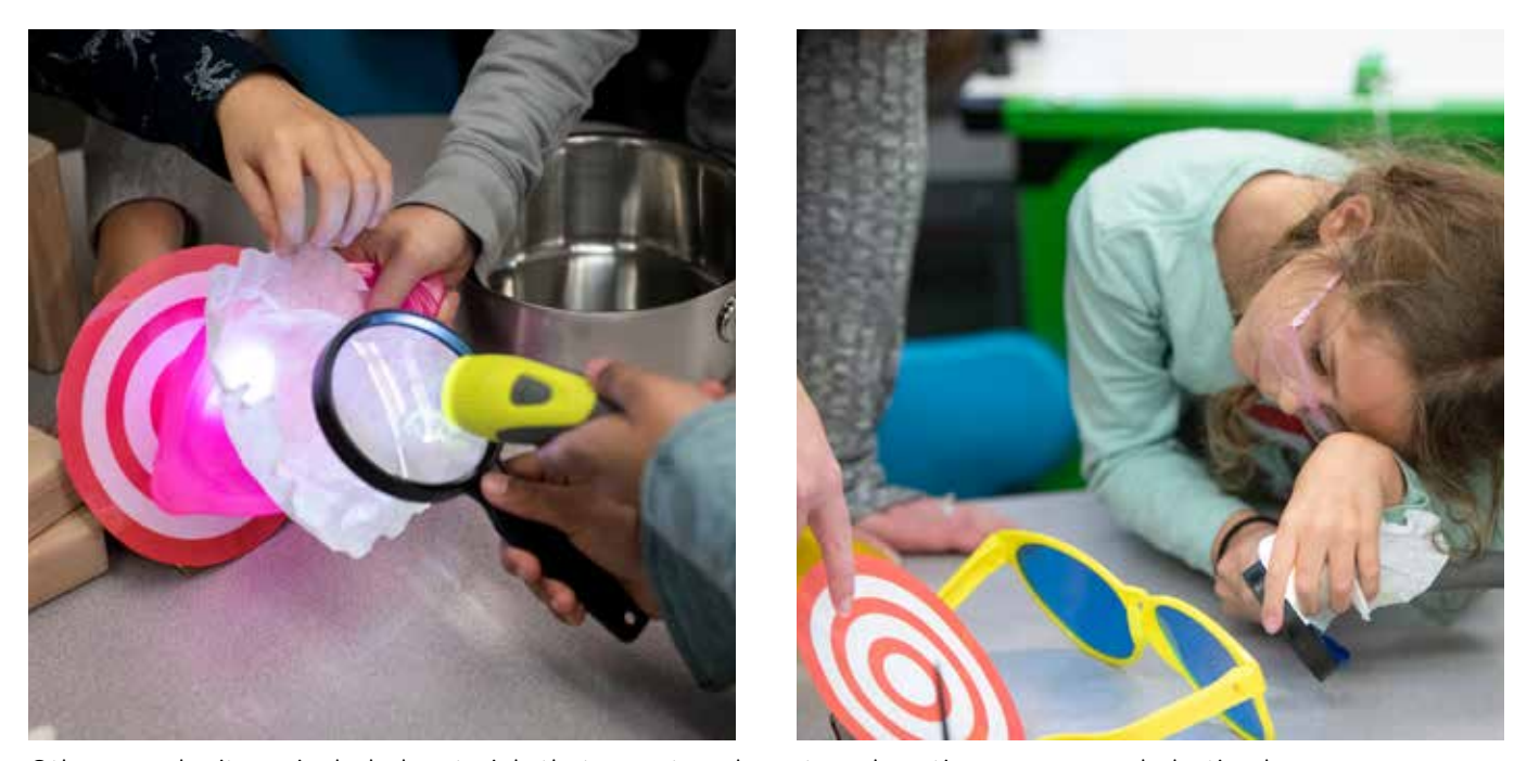
Other popular items included materials that were translucent, such as tissue paper and plastic glasses.