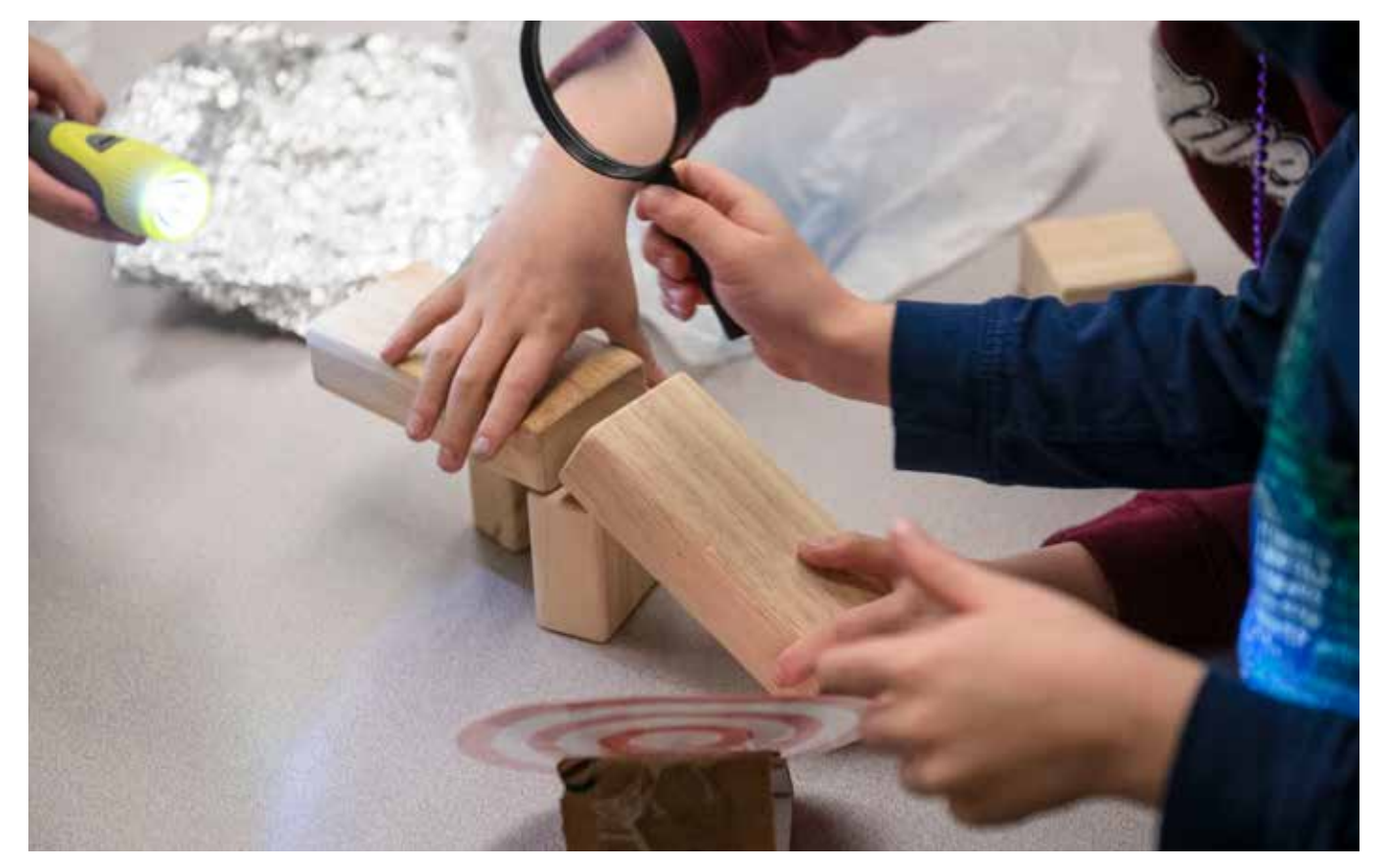
This "obstacle course" for light included blocks, aluminum foil, a magnifying glass, and a target.

As teachers circled the room, some groups were working more seamlessly than others. Students who were experiencing roadblocks in communication were guided to work together with suggestions such as, "This student has an idea, how can we work together to test it?" Students were placed in small groups of between three and five students with a set of similar materials. The materials were chosen intentionally so that all groups started with some materials that were opaque (wooden blocks, stuffed animal), translucent (sunglasses), transparent (magnifying glass), and reflective (tin foil, pan, mirror). The openended nature of the task allowed for differentiation as students approach the problem from various skill levels. Teachers can more specifically support their students such as providing dual language learners with picture vocabulary cards or altering the method for providing directions.