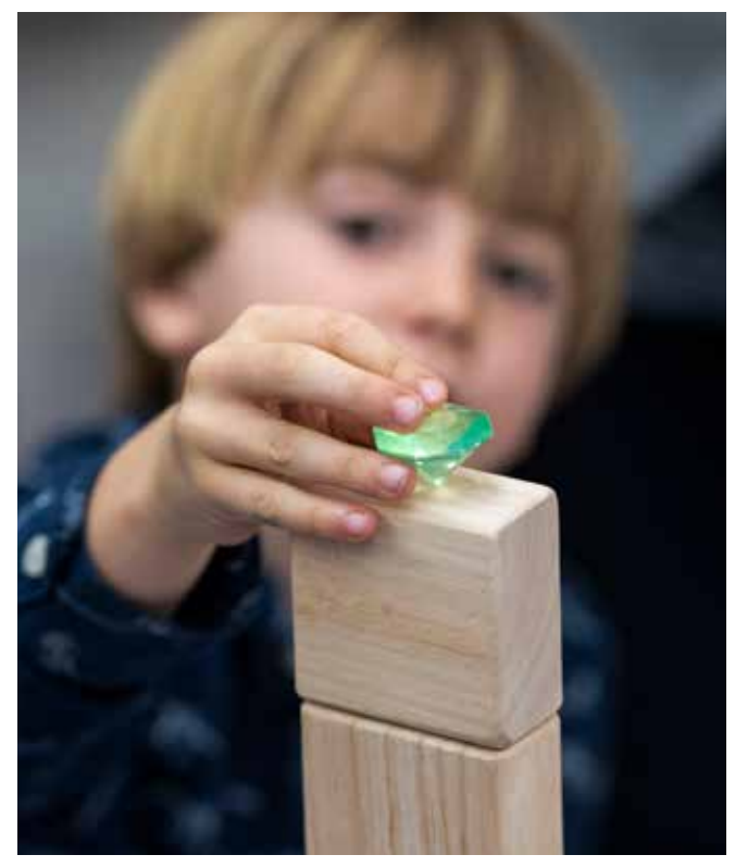
Prisms were a popular item with students.

We asked students to confront an engineering challenge: design and build an obstacle course in which a beam of light would interact with three objects before hitting a target. We briefly explained the engineering design cycle, and students were placed in small groups of between three and five students with a set of similar materials. We talked with students about how to listen to each other's ideas during group work.