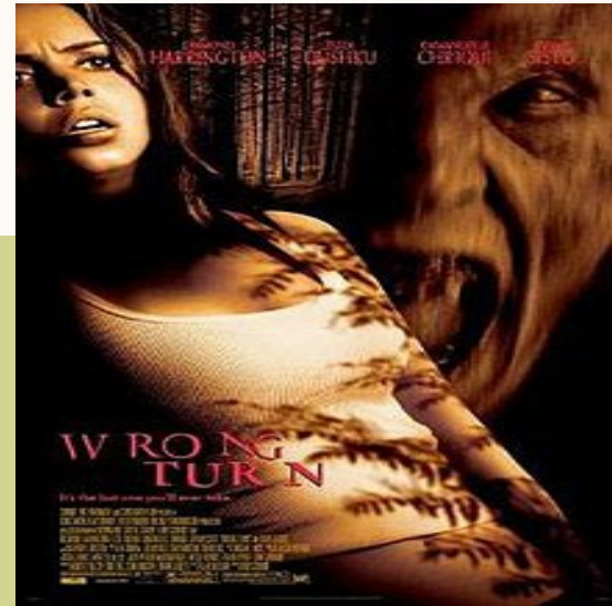
Wrong Turn (2003)