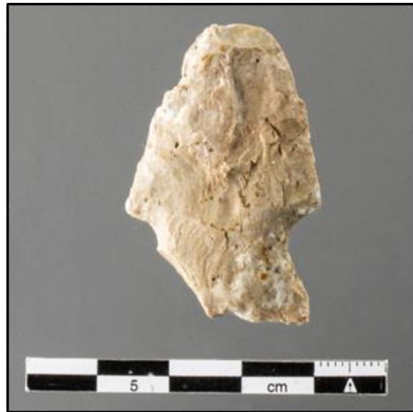
Figure 4: ETSULC-BC1, Bakers Creek

BC1 (figure 4) is a chert point with a broken stem and distal end. Despite the breakage, it is possible to place this within Bakers Creek typology due to the clearly expanding stem, the narrow and tapered shoulders, the bi-convex cross-section, and the placement of the shoulder at around one-third of the maximum length.