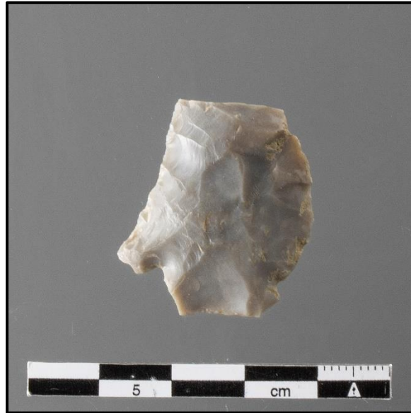
Figure 6: ETSULC-DR1, Decatur

intact. Though the base is broken on either side, an incurvate basal edge can be assumed from the curvature on the base. The maximum length of the point is on the low end of the accepted range, even in the broken state.