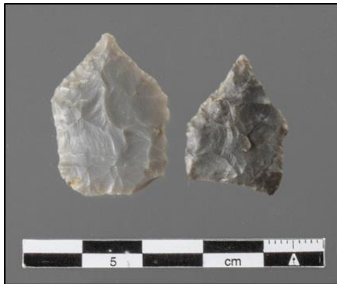
Figure 12: ETSULC-JRP 1-2, Jacks Reef Pentagonal

JRP1 and JRP2 (figure 12) are both clearly pentagonal in shape with all features of the typology present. The corner edges of the base of JRP1 are either broken or worn and this example is slightly longer than JRP2. This morphology is well represented in illustrations, as it is a relatively simple shape.