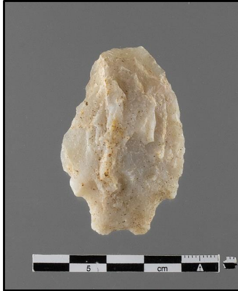
Figure 25: ETSULC-STS1, Stanly Stemmed

STS1 (figure 25) is a well-worn example of Stanly Stemmed (Dean). The notched base, straight stem, and bi-convex cross-section fit perfectly into the typology. The distal end is worn or obtuse and the shoulders are worn or eroded away, though tapered shoulders are within the typology. There is evidence of beveling and could indicate a reworked blade.