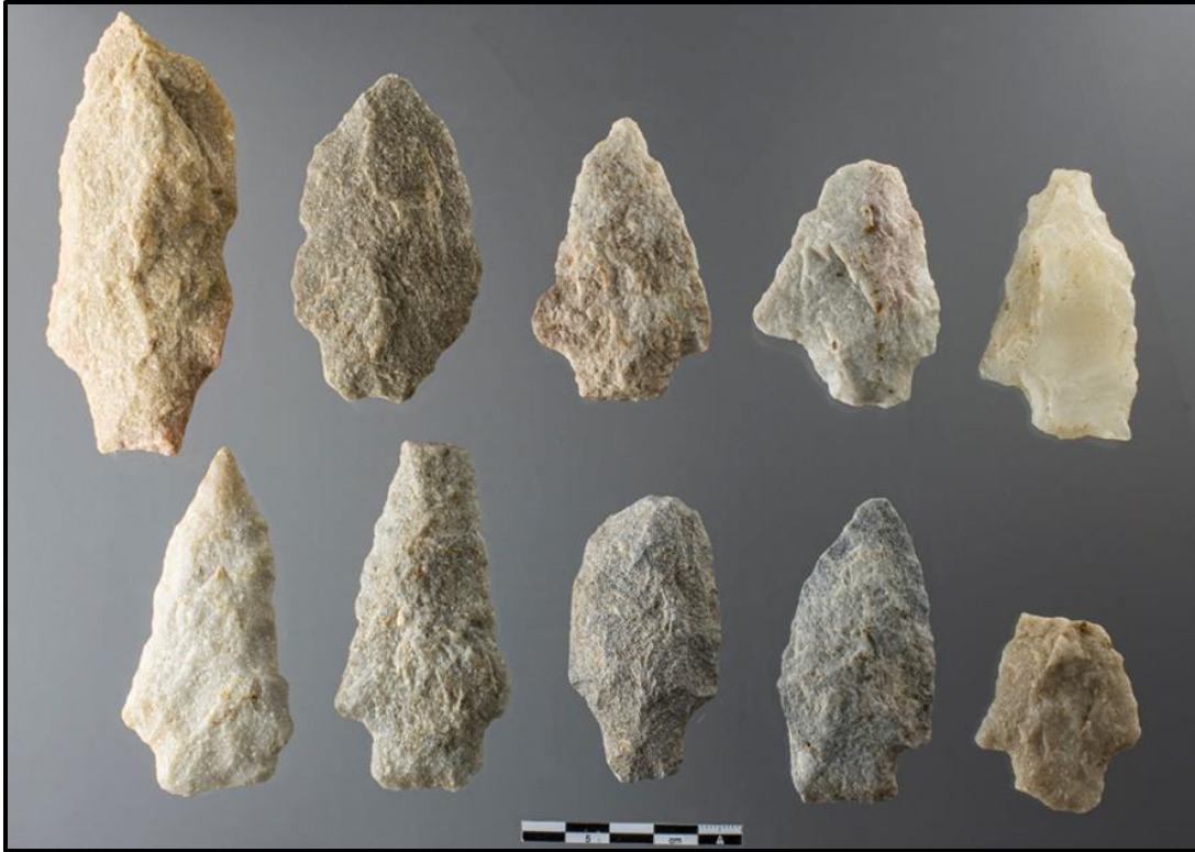
Figure 3: Appalachian Stemmed Points. Top, left to right, ETSULC-AS 1-5. Bottom, left to right, ETSULC-AS 6-10

AS1 features a uniquely recurvate blade shape on both edges. It is unclear whether this was due to wear or intentionally shaped. The distal end is acute and off center. Upon closer inspection, the opposite face of the distal end shows a breakage, indicating the pointed tip pictured is not the original distal end. This is a rather large projectile point, indicating it was either broken during manufacture or soon thereafter, having no sign of resharpening. Flaking is rather deep and random, offering a crude appearance on each face. The blade of AS2 is broad and excurvate, though there appear to be a notch on either blade edge about half-way between the distal end and shoulder. AS3 is the only example without an incurvate base. It is straight and appears to have been either intentionally left unfinished or broken in a straight line. Toward the smaller end of the accepted size range, it is possible this was resharpened. AS4 has one shoulder more prominent than the other. The distal end shows wear from regular use. AS5 shows evidence