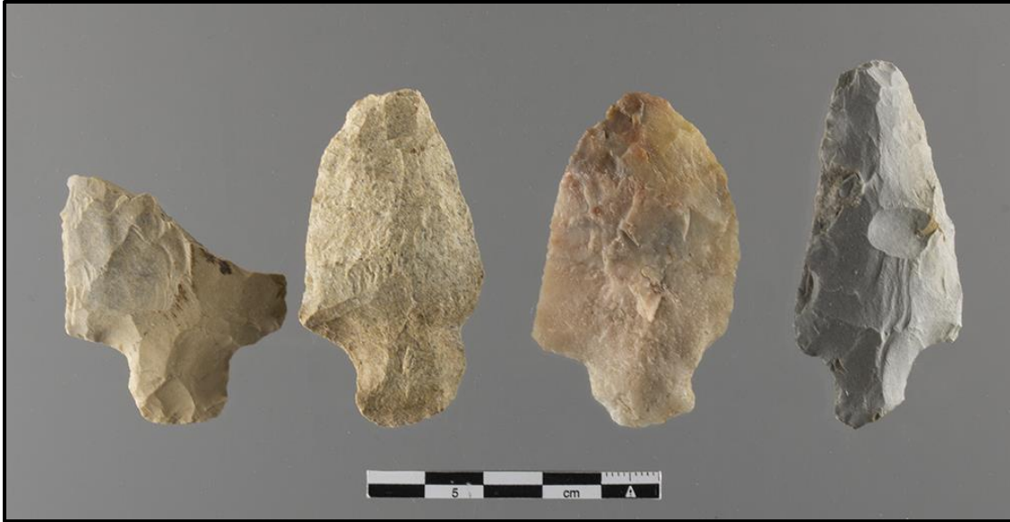
Figure 15: ETSULC-LB 1-4, Ledbetter