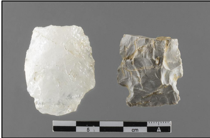
Figure 27: ETSULC-SY 1-2, Sykes