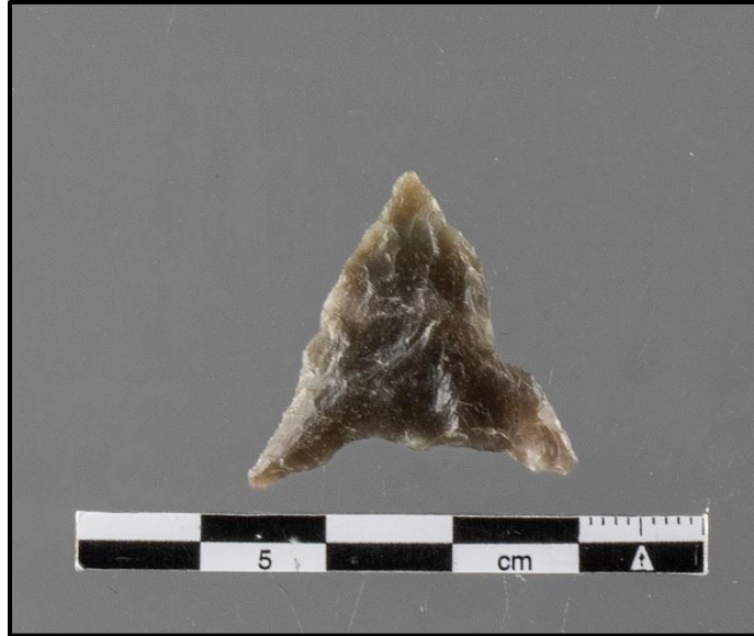
Figure 16: ETSULC-LV1, Levanna