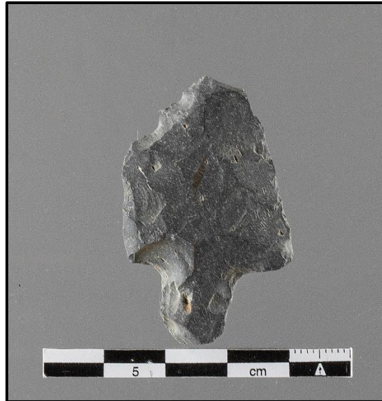
Figure 17: ETSULC-LBC1, Little Bear Creek