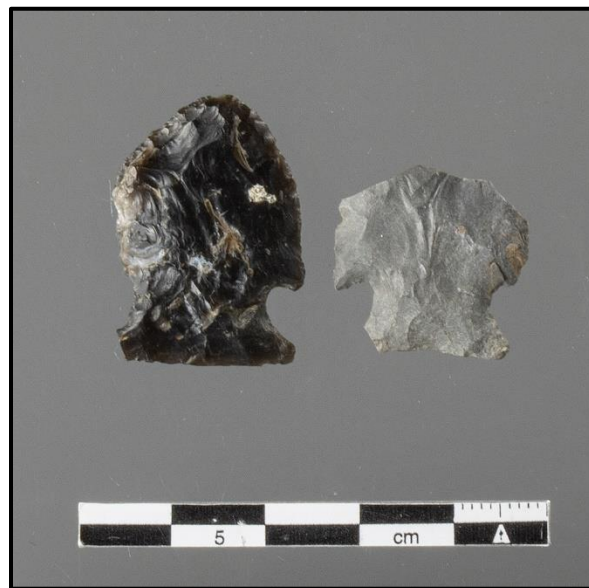
Figure 11: ETSULC-JRCN 1-2, Jacks Reef Corner Notched

JRCN1 and JRCN2 (figure 11) are both extremely thin with flattened cross-sections, both are corner notched, and both have basal edges that are straight and thinned. JRCN1 has a broad distal end with evidence of fine reworking around the blade edges. One shoulder is broken as is the expanded base on the same side, but the shoulder that is present shows a slight barb and expanded base. Though JRCN2 is quite damaged, the corner notch is clearly seen, one thin barb is present from one shoulder, and the cross-section thickness, which is the clearest indicator of the typology. The base may have been slightly incurvate. In this instance, the most likely typology for both is Jacks Reef Corner Notched.