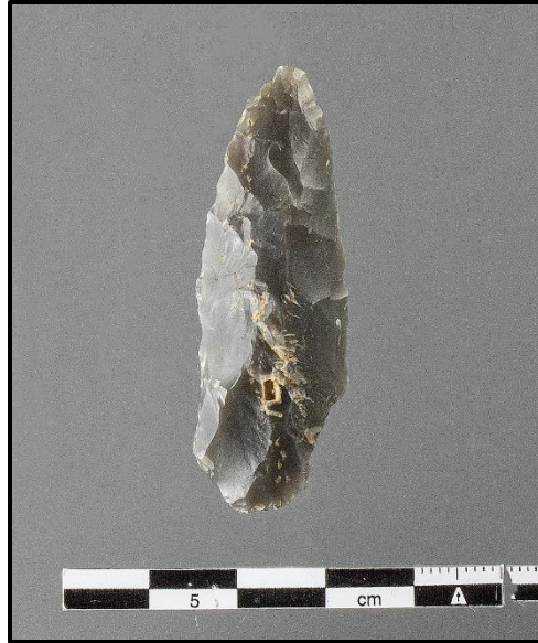
Figure 8: ETSULC-FRS1, Flint River Spike