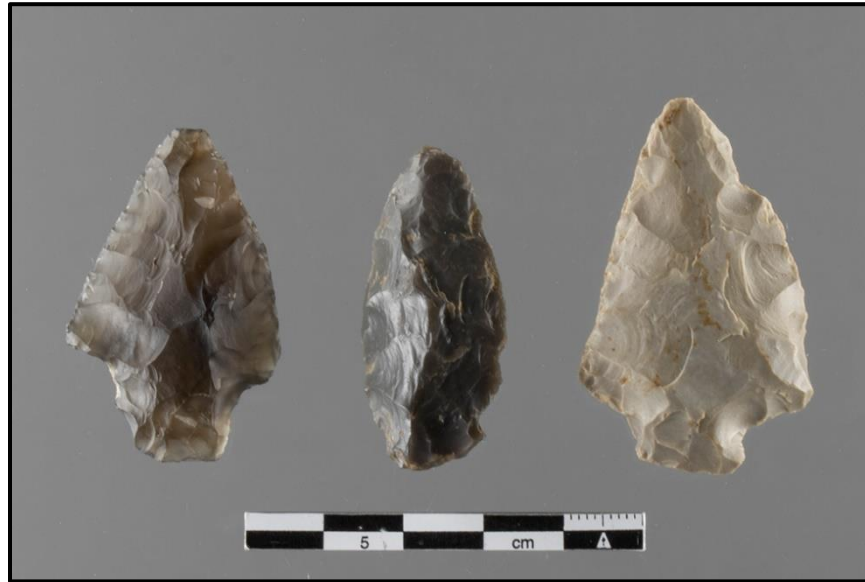
Figure 24: ETSULC-SB 1-3, Snapps Bridge

into the stem. This is evidence of resharpening, but still fits within the Snapps Bridge typology (Dean). SB1 and SB2 have no notable deviations from the typology.