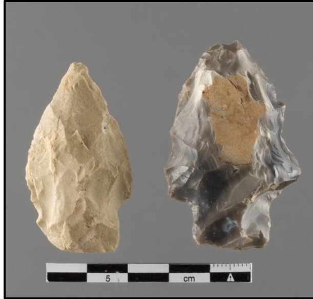
Figure 22: ETSULC-SBB 2 and 1, Saratoga Broad Bladed (pictured in reverse order)