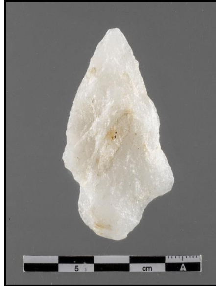
Figure 18: ETSULC-MMII, Morrow Mountain II