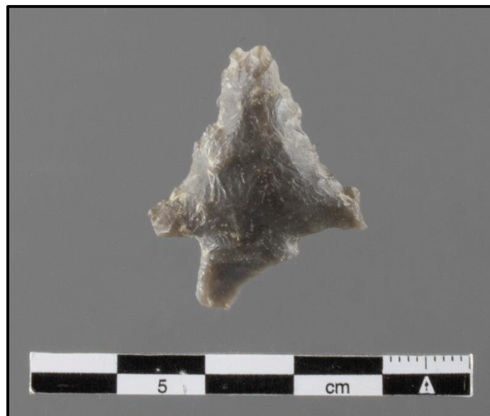
Figure 13: ETSULC-KS1, Kanawha Stemmed

KS1 (figure 13) is most consistent with the Kanawha Stemmed typology in having incurvate blade edges that show secondarily serrated edges, extended shoulders, and thinning scars present on the intact portion of the base. Because the base is broken, it is impossible to determine whether the base is bifurcated or notched; however, the rest of the morphology of this point align well with the Kanawha Stemmed typology.