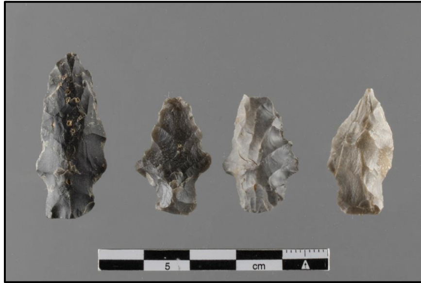
Figure 19: ETSULC-NM 1-4, New Market

basal edge of NM4 is not retouched like the others, which could be indicative of some of the plesiotypes that showed no expanded shoulders when bases were not retouched (Cambron and Hulse 96).