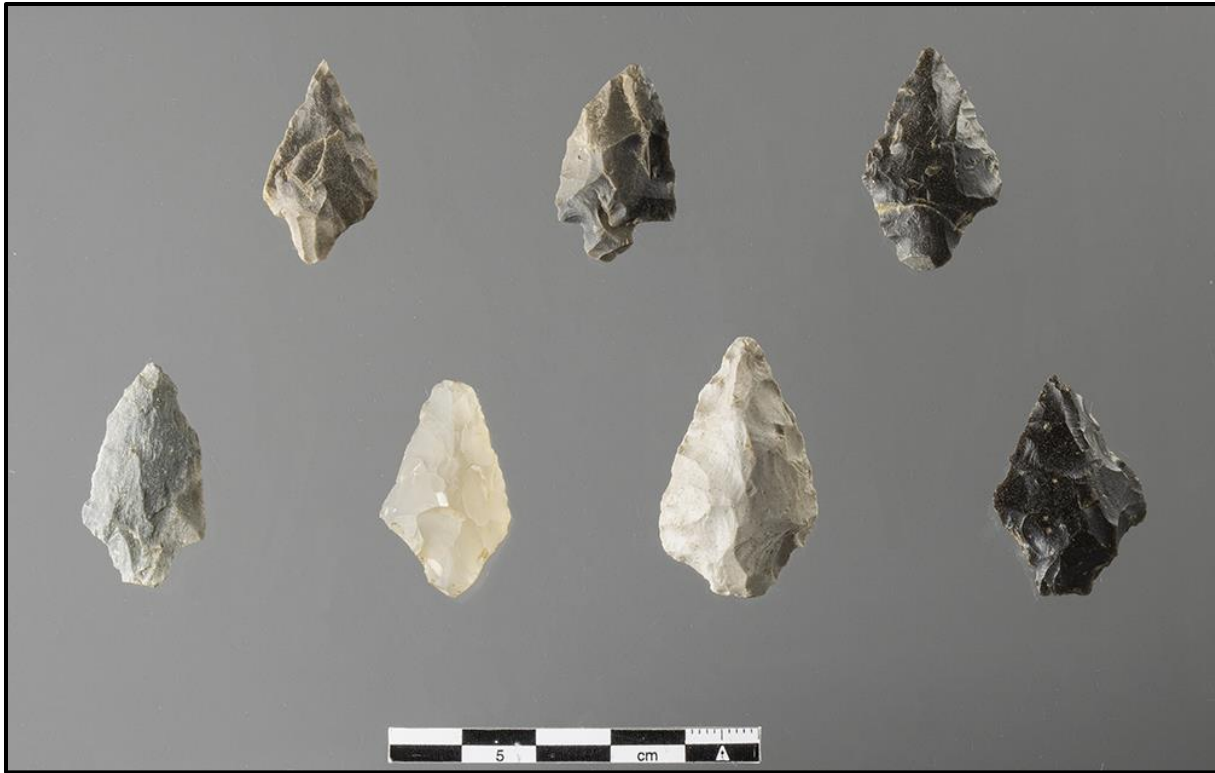
Figure 7: Left to right: ETSULC-EB 1-3 on top, EB 4-7 below, Ebenezer