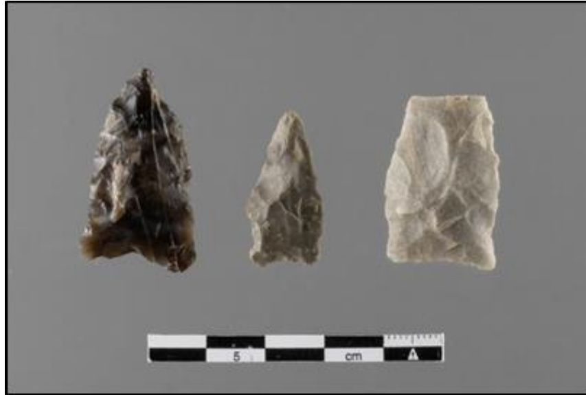
Figure 20: ETSULC-NL 1-3, Nolichucky

have a bi-convex cross-section, excurve blade edges, incurvate hafting area side edges, incurvate basal edges, and auricles. NM1 has rounded, prominent auricles and is crudely manufactured. NM2 is a very small example, but all features are compatible with the typology. NM3 is a larger variety with a broken distal end, yet it is possible to see that the blade is excurve. The auricles are more pointed and less prominent.