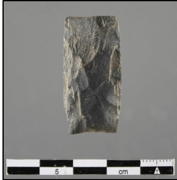
Figure 5: ETSULC-DE1, Dallas Excurvate