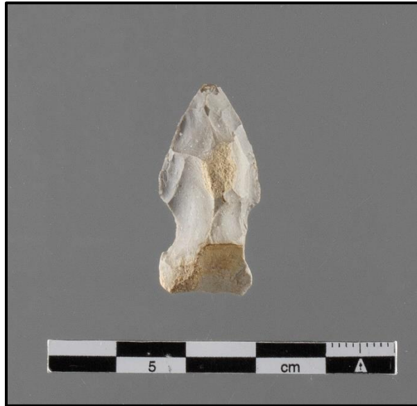
Figure 26: ETSULC-SL1, Swan Lake

also narrow and tapered, the blade edges are straight, and one blade face also has a portion of cortex remaining.