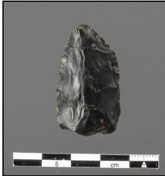
Figure 9: ETSULC-GV1, Consistent with Greeneville Preform