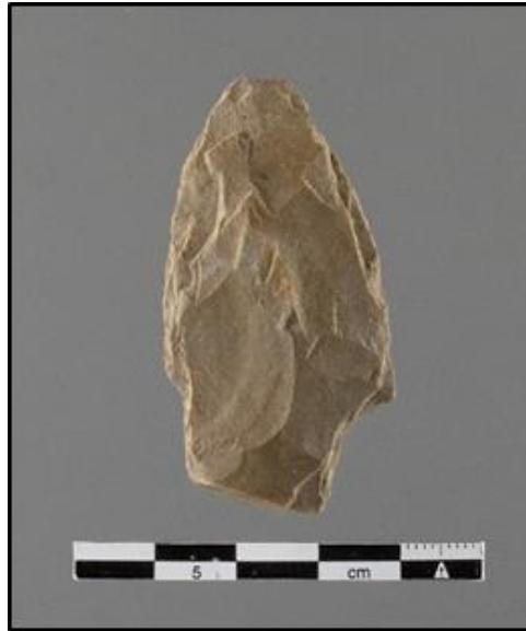
Figure 23: ETSULC-SPS1, Saratoga Parallel Stemmed