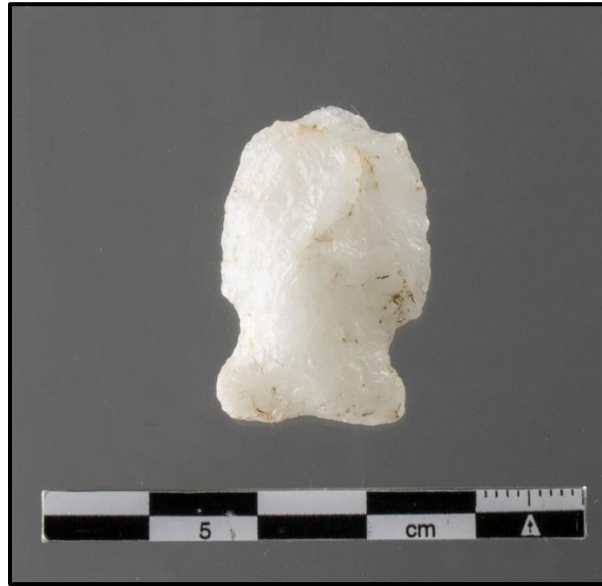
Figure 10: ETSULC-HSN1, Halifax Side Notched

acceptable range for the typology. These characters all align with the typology, despite the missing distal end.