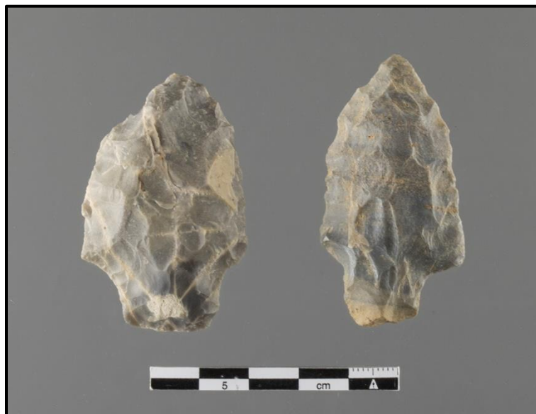
Figure 21: ETSULC-OS 1-2, Otarre Stemmed

Both examples (figure 21) are representative of the described typology for Otarre Stemmed (Dean). The only notable difference is that OS2 is plano-convex, which is likely not enough to suggest a different typology.