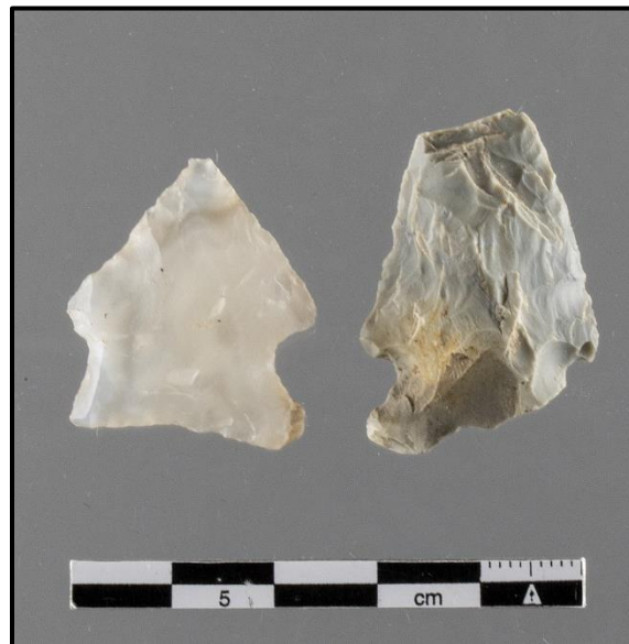
Figure 14: ETSULC-KCN 1-2, Kirk Corner Notched

KCN1 (figure 14) is consistent with an extremely worn Kirk Corner Notched point (Dean). The barbs are not present, though they may have been broken or worn from use, resharpening, or weathering. The distal end is acute, the blade is straight with signs of serrated edges, the stem is corner notched, and the basal edge is incurvate. KCN2 has a broken distal end, broken barbs, and one side of the base is also broken. Despite this, it is possible to determine that the stem is corner notched, the blade has evidence of serration on straight edges, and it likely had an incurvate base. Both examples have bi-convex cross-sections. They both are most consistent with the Kirk Corner Notched typology.