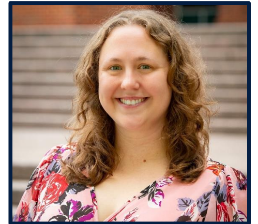
Charles C. Sherrod Library