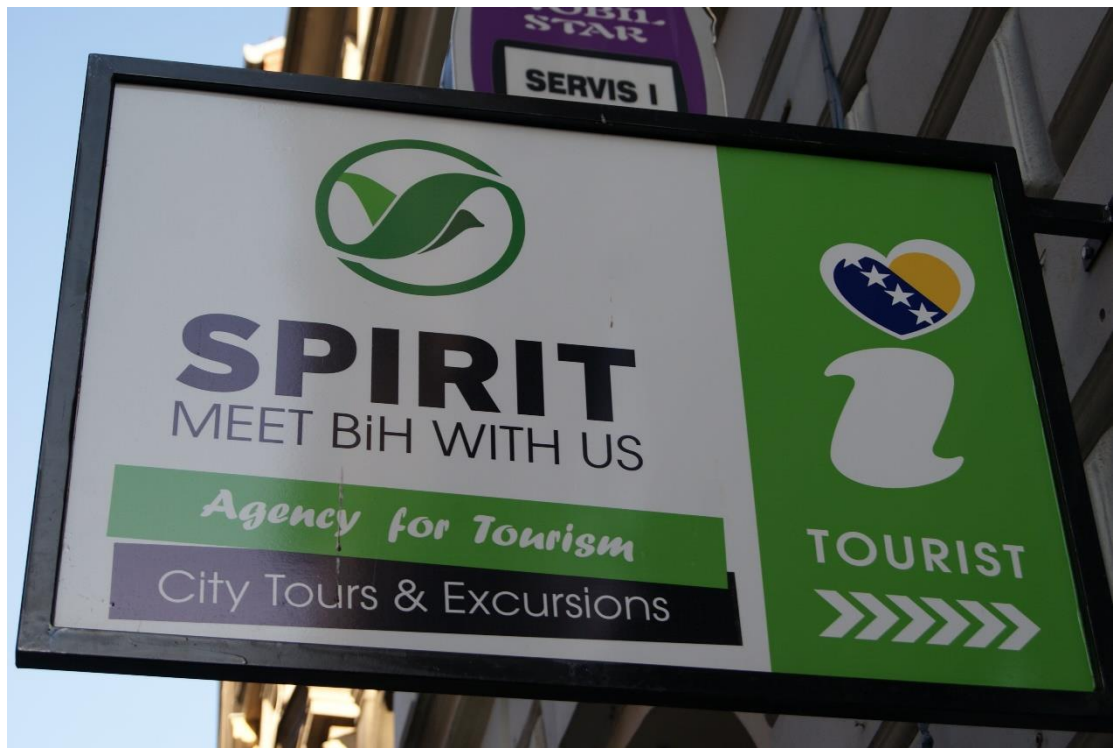
Figure 8 (right): A travel agency has written its sign exclusively in English.