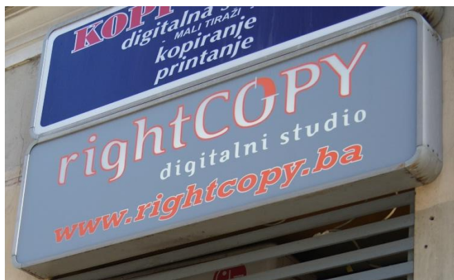
Figure 17 (above): A copy shop's name in English implies professionalism. English on copy shop signs was very common in this photoset.

The related use of English to imply high class or exclusivity had a similar structure: names of shops or establishments were often in Bosnian with an English tagline or description, or had an