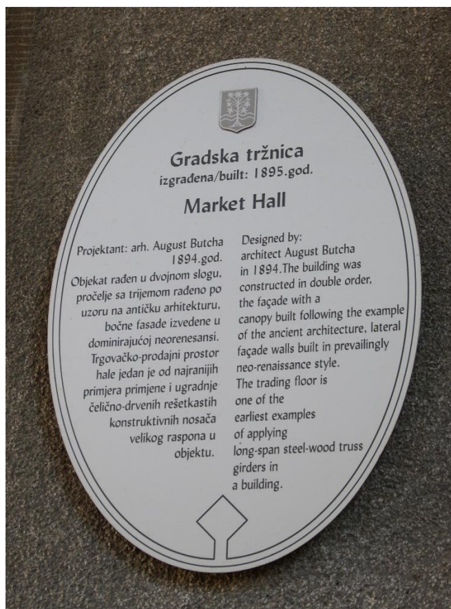
Figure 2 (below): A sign describes the history of Market Hall in Bosnian, Serbian, and English.