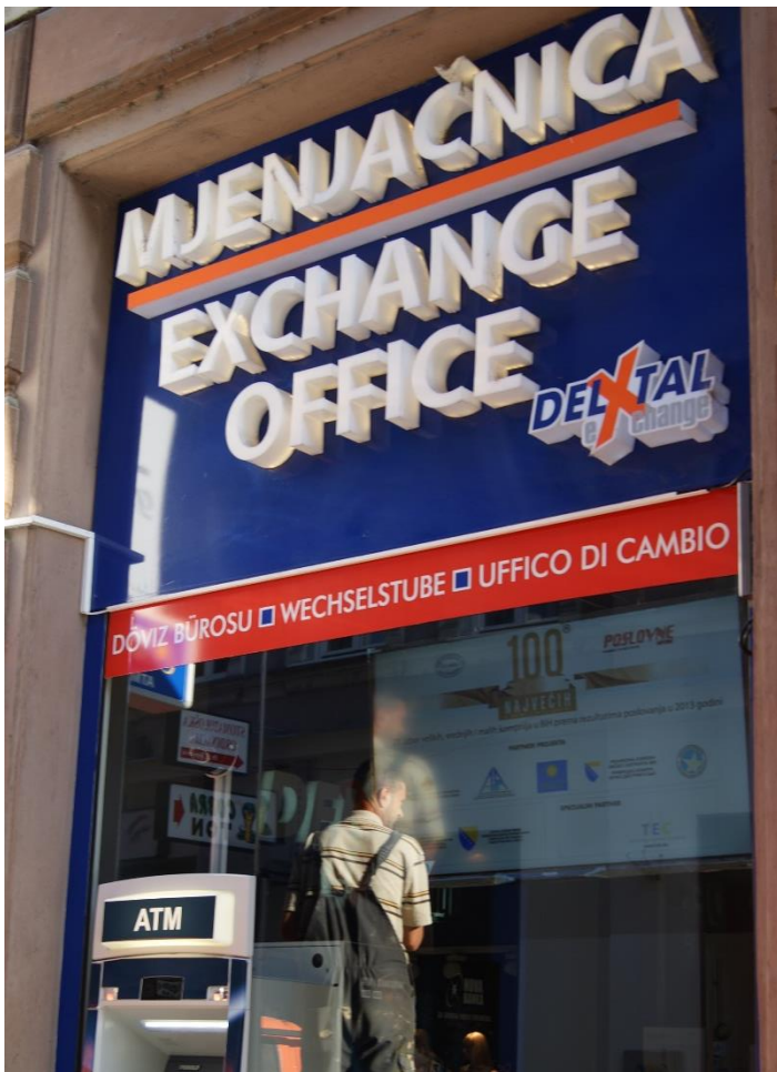
Figure 9 (left): A currency exchange office sign in English, as well as other languages.