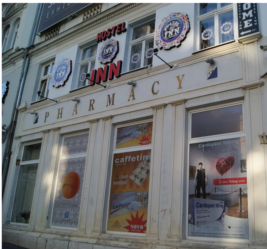
Figure 6 (above left): A pharmacy makes itself obvious to English speakers.