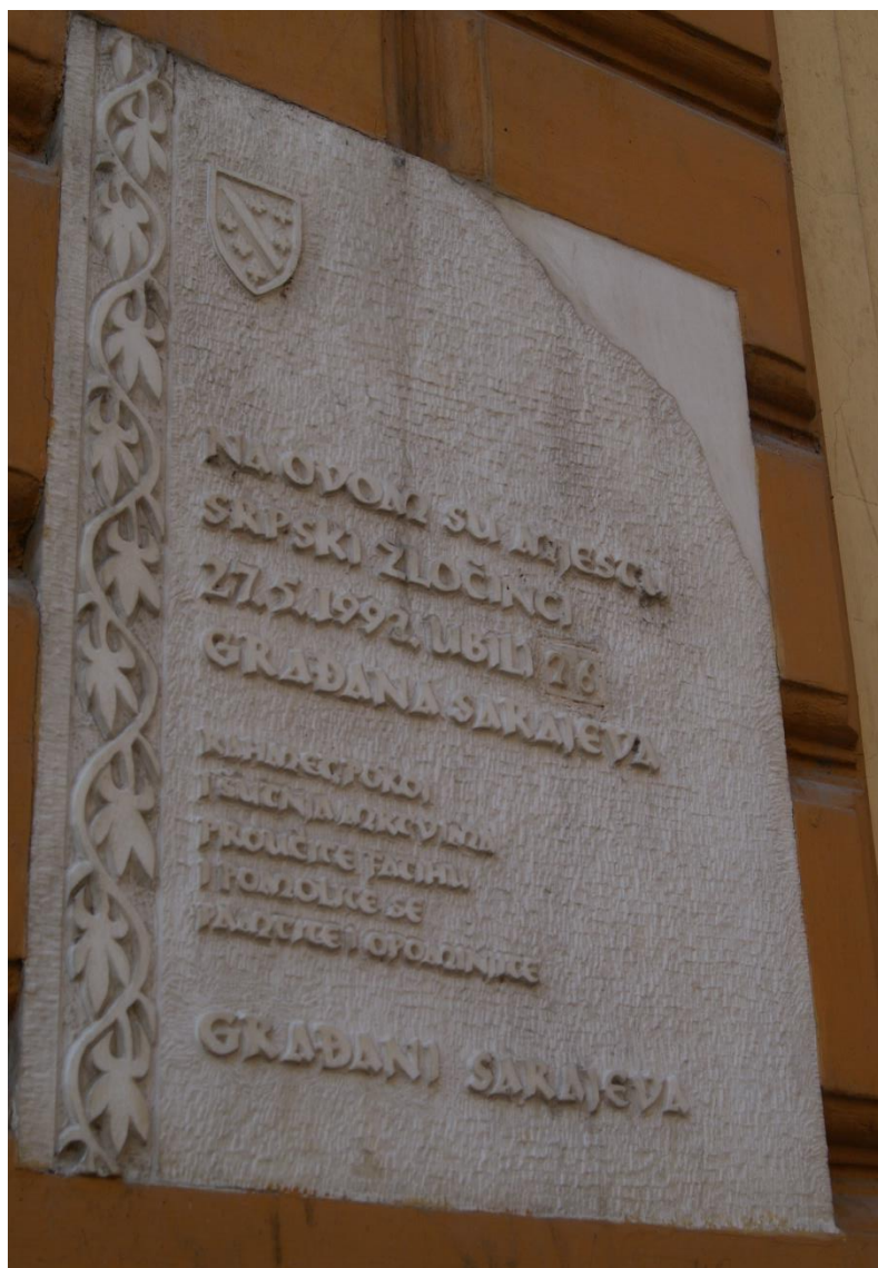
Figure 3 (above): A plaque memorializes those who died in the bombing of Market Hall and condemns the “evil Serbs” who killed them.

of the building.” Across the street, this plaque (Figure 3) memorializes those who died and were injured in the attack, but only in Bosnian – it uses the phrase “evil Serbs” in describing who the attackers were, making the exclusion of the Serbian language, on this sign and on the rest of the street, seem very pointed. The difference between the first two signs – that the violence is