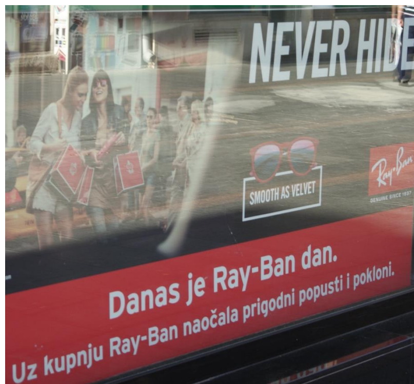
Figure 12 (left): Mango announces its "new collection" in English. Figure 13 (right): Ray-Ban makes its primary point in Bosnian, but slogans "never hide" and "smooth as velvet" are in English.

English in this photoset is not only used to accommodate internationals; Bosnian establishments also use it to attract Bosnians. Establishments in industries that rely on trends, fashion, or professionalism often, or even usually, had at least parts of their signage in English. Based on these photos, it appears that displaying certain words or phrases in English rather than in Bosnian can lend a sense either of stylishness and trendiness or of high class and exclusivity. English in the former category occurred frequently; Figures 14-16 are illustrative examples. Many establishments use an English word or phrase either as a name or as a tagline or slogan, making them appear modern and fashionable. The word "style" itself appeared in slogans or taglines multiple times.