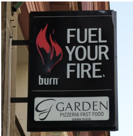
Figure 14 (top): A cafe explains itself in English.