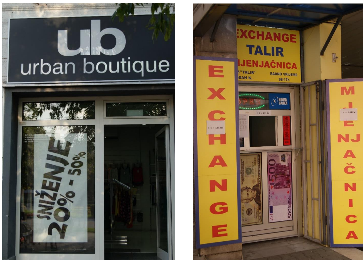
Figure 3 (left) and Figure 21 (right): English implies style and draws attention to services a traveler will likely need.

The primary difference between the numbers in the photosets is in the ratio of Bosnian to Serbian. The Sarajevo data featured Bosnian in almost all signs and Serbian in almost none; given Banja Luka's Serb ethnic majority, one might expect its photoset to feature Serbian in almost all signs and Bosnian in almost none, but this is not the case. Not even a majority of signs contained Serbian. Considering that popular opinion in the Republika Srpska supports independence from Bosnia for the entity, the relatively small presence of the Serbian language seems strange.