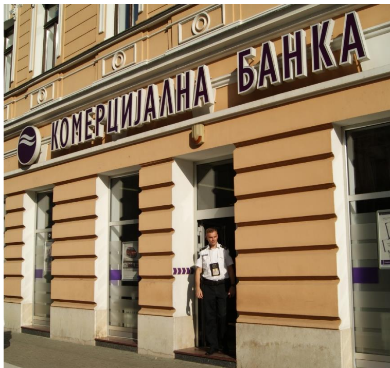
Figure 23: A bank's sign is only in Serbian.

Only very rarely did Serbian appear with Bosnian on the same signs or on signs for the same establishments. Below are the only two examples from the Banja Luka photoset of Bosnian and Serbian occurring together. The first example (Figures 24 and 25) is signage for a cultural center, an establishment which, like the Inter-Religious Committee in Sarajevo, would predictably want to promote ethnic integration and harmony.