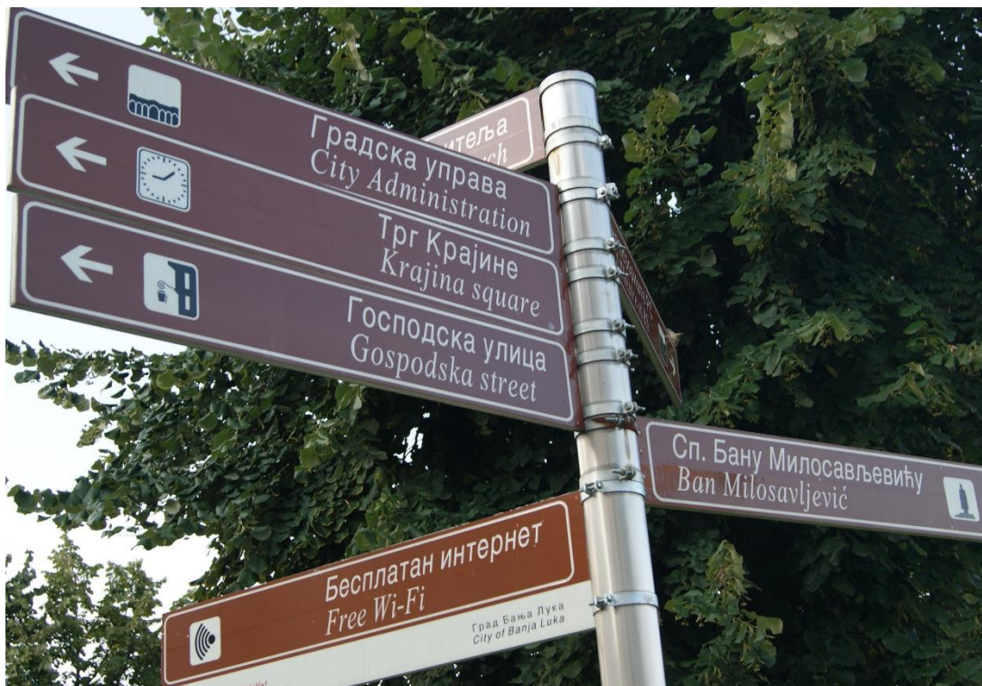
Figure 22: A street sign gives street names in Serbian and English.

When Serbian appears in this photoset, it usually appears alone or with English, as illustrated in Figures 22 and 23.