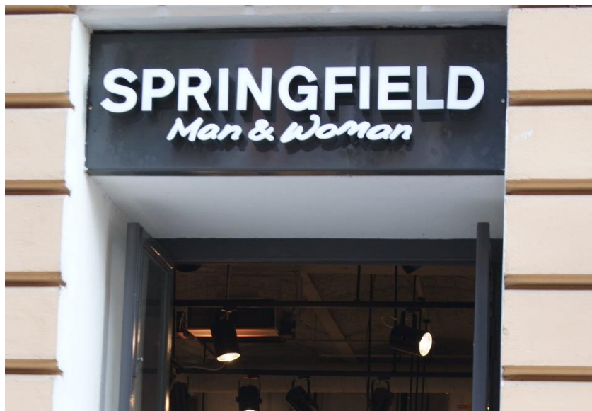
Figure 19 (above) and Figure 20 (below): International brands and trendy phrases appear in English.

English in the Banja Luka photoset is used similarly to the way it appeared in the Sarajevo photoset, where it occurred in appeals to internationals, with international brands, and for the appearance of high fashion or class, as shown in Figures 19-21. English appears less frequently in the Banja Luka photoset than in the Sarajevo photoset, which may be because Banja Luka is a less popular tourist destination than Sarajevo.