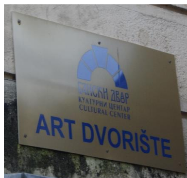
Figure 24 (left) and Figure 25 (right): Signs for a cultural center, located within several yards of one another, have text in Serbian, English, and Bosnian.