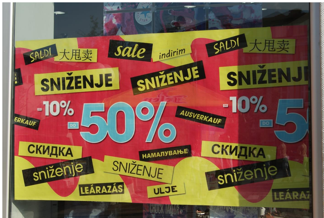
Figure 26: A sign announces a sale in various languages, including Bosnian, Serbian, and English.

The second example, shown above in Figure 26, is a sign at a shoe shop advertising a sale, and includes the word “sale” in several different languages. That Bosnian and Serbian appear together here may not be entirely meaningful, as the theme of the sign is “all languages” and not “languages of Bosnia.”