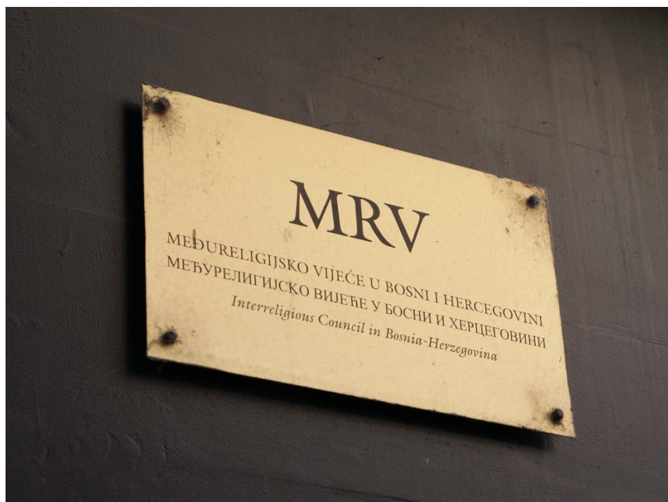
Figure 4 (right): A sign for the Inter-Religious Council in BiH in Bosnian, Serbian, and English.

The exclusion of Serbian from signs in Sarajevo could be explained in a number of ways, first among which is the inconvenience of the Cyrillic alphabet. Some speakers of Bosnian, which uses the Latin alphabet, may not be able to read Cyrillic, but most Serbs can read the Latin alphabet – so a large proportion of signs in Serbian may be a great inconvenience for some Bosniaks, but a large number of signs in Bosnian would not be technically inconvenient for most Serbs. Another possible explanation is that Bosniaks harbor resentment against Serbs for war crimes committed by Serb soldiers during the war, and so do not wish to see the Serbian language on a daily basis or to accommodate Serbs.