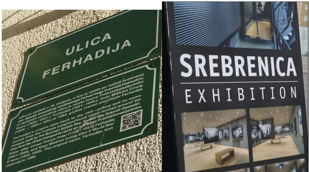
Figure 11 (bottom right): A sign in English advertises an exhibition on the 1995 massacre in Srebrenica. Internationals often travel to Sarajevo for commemorations of the tragedy.

As Bosnian establishments use English to accommodate and appeal to internationals, international brands in this photoset also rely on English to ensure that their slogans and advertisements are widely understood abroad. This use of English is especially clear in fashion brands, as shown in Figures 12 and 13.