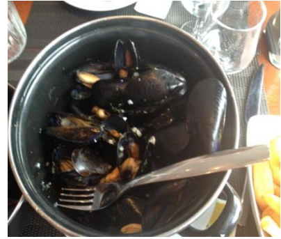
Sunday, 9 June 2013: The best cheap meal in France, mussels

Katie was starving since we hadn't eaten all day and it was almost one in the afternoon. We searched up and down the port for a restaurant that wasn't too crowded. We were not in the mood for a wait. We spotted a restaurant that looked pretty decent. It wasn't as close to the water as I would have liked it to be, but it did have a sign out front that said "Moules et Frites €12." Fresh muscles sounded absolutely amazing.