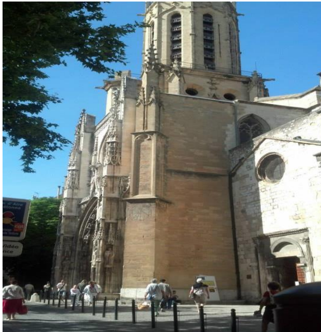
Monday, 10 June 2013: Outside Cathedral St. Sauveur

people had visited this very church, praying to Mary so that she would relay the prayer to her son. She looks out for his followers. I blamed my mom for a long time for the collapse of our family, for forcing me to grow up in a matter of minutes, for basically anything I could blame her for. She should have been there for my dad, my sister, my brother, and for me. But parents make mistakes. I'm sure Mary made a few; they just probably didn't make it into the many pages of The Bible .