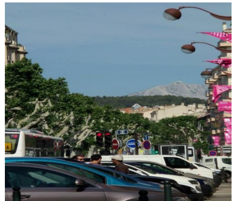
Saturday, 22 June 2013: View of Mt. Victoire from Blvd Roi René

It seems like there is a garden hiding around every corner. You never know when one will pop up. The sign of being in the presence of a garden is a large iron gate and pebble walkways. I would walk into a gated area thinking I would not really find anything but then there