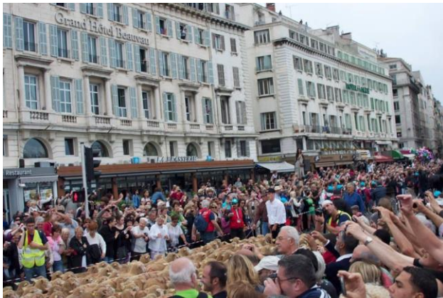
Sunday, 9 June 2013: Street view of Transhumance