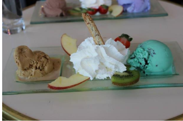
Sunday, 9 June 2013: The best display of ice cream I have ever witnessed

I still had questions though. Like where were the thousand or so sheep now? It is not like they could just disappear, and there is no farmland in sight in Marseille. So these animals were being held somewhere. Surely we could still see some of them. That way the whole trip wouldn't be a waste. And about thirty minutes