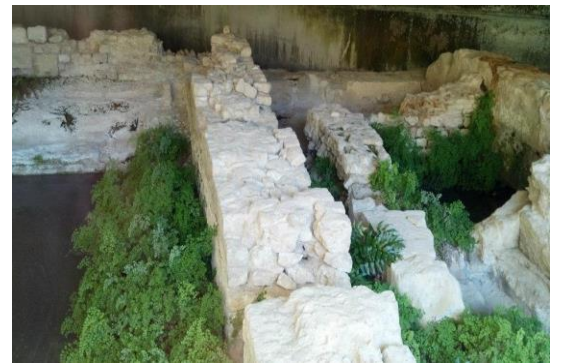
Wednesday, 5 June 2013: Remains of original Roman baths

The town originated in 123 BC, thanks to the Romans on one of their many conquests. Aix was settled because of its close proximity to natural springs, which would later become a site for the infamous Roman baths. Today, the site of the baths is still visible. Its remains can be glanced at through thick plexi-glass put up by the world-famous spa Thermes Sextius, built adjacent to the original ruins, which claims on