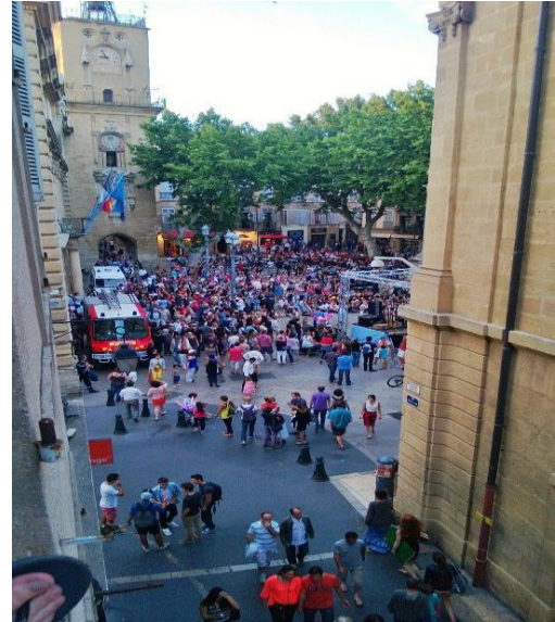
Friday, 21 June 2013: A view of Place Richelme from the apartment window

it is to wear close-toed shoes. I didn't sustain too many injuries, just a gash on my big toe, but it could've had the potential to be much worse. The rest of the group we were left with decided to try