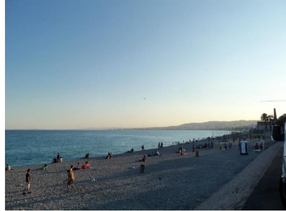
Sunday, 30 June 2013: A plane in the distance viewed from the public beach in Nice, France