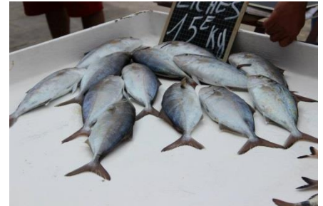
Tuesday, June 18 th 2013: Market de Place Richelme

I would also stop by Place Richelme, another square, where the best of French delicacies were sold. You could buy fresh meat, fruit, vegetables, cheeses, and other varieties of food like pasta salads. Most of us students would stop by in the morning and get something to take for lunch. It was so inexpensive but delicious. One day I ended up buying a little carton of strawberries. I was skeptical at first because they were hardly red, more like a coral color, but when I popped one in my mouth, it was like I had stepped into a Willy Wonka factory. It was the best strawberry I had ever eaten. It almost melted in my mouth it was so ripe. I could not believe that a strawberry with hardly any color could be this good. It made me wonder what the hell they put in our American strawberries because there is no comparison. I was ready to go on a strawberry-only diet for the rest of my trip, until my house mom apologetically informed me they were no longer in season. The one thing about this market is that you have to arrive before noon. By then most everything is packed up and the streets are hosed down. This is the only market that gets cleaned because of all the ice that melts from holding fresh seafood. It takes a good rinsing and about an hour of people walking through before the smell finally fades away.