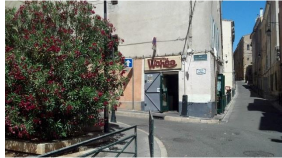
Saturday, 18 June 2013: Our favorite hangout The Woohoo

By the end of the night we ended up back with almost half of our group. We celebrated la Fête for the next couple of hours until three a.m. when bands started packing up.