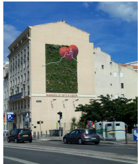
Sunday, 9 June 2013: Advertisement on a building in Marseilles

Traditionally, it is the movement of herds of sheep, horses, and other farm animals from higher pastures in summer and lower pastures in winter. Now it was going to be celebrated in Marseilles. It was organized by Marseille-Provence 2013, European Capital of Culture, in partnership with Morocco, Italy and Provence. This unique European project is for horse riders from Europe and the Mediterranean region who love adventures. The herd departed Cuges-Les-Pins, Italy on