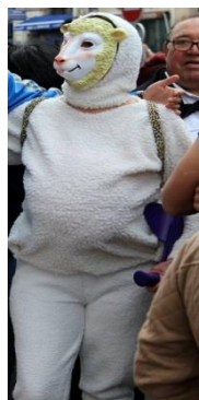
Sunday, 9 June 2013: Man dressed for Transhumance

There was nothing nomadic or ritualistic about this Transhumance. It was all a show. We made the journey all the way to Marseille to see a bunch of animals being hauled on a truck. We sat at the restaurant and just took our time eating and relaxing, as most French do. After two and a half hours, we left the restaurant, feeling full of life and good food. We headed for the beach and soaked up all that Marseille had to offer us for the rest of the afternoon.