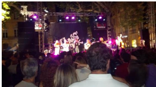
Friday, 21 June 2013: The main stage on Cours Mirabeau

Midnight- By this time you could just hear the symphony of bottles crashing to the ground every second. And that's one thing about the French, they don't drink beer from a can. The ground was covered with green and clear colored shards of glass. If there is one thing I learned about the fête,