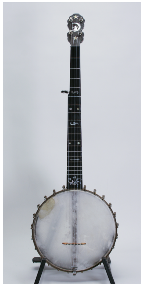
Image 2. Dobson Matchless Banjo

This is a very interesting Dobson with mahogany neck and ornate pearl inlays including a crescent moon and cherub playing a horn.