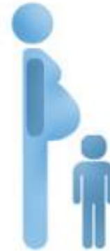
Pregnancy, Childbirth & Breast Feeding