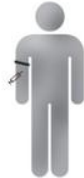
Injection Drug Use