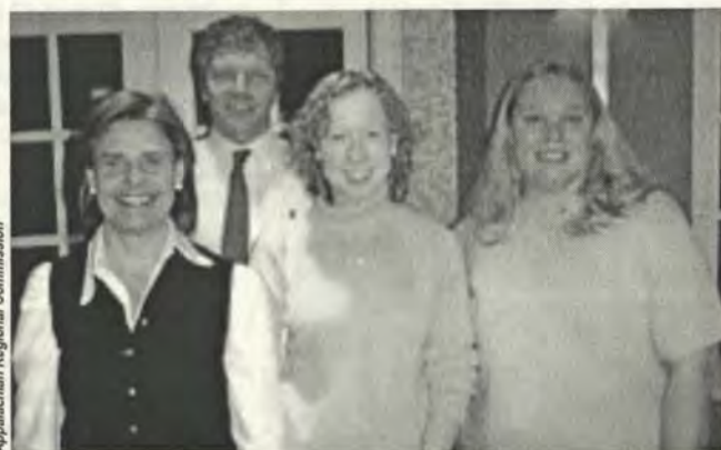
Appalachian Regional Commission