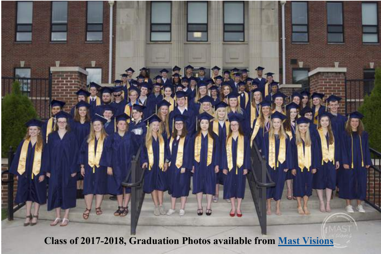
Class of 2017-2018, Graduation Photos available from Mast Visions