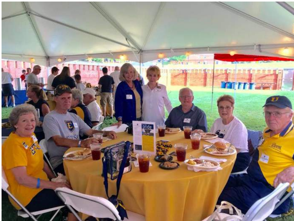
University School Alumni at President's Circle Tailgate