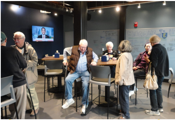
Building 60 Tour photo.