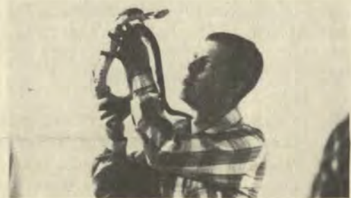
From "Appalachian Serpent and Fire Handlers:..."